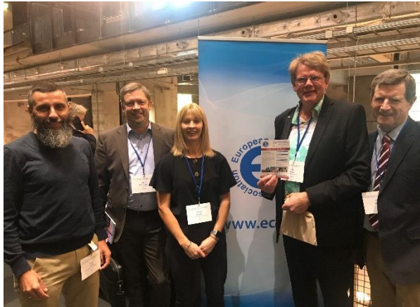
Members of the Student eID Framework project advisory committee at the eID Forum

In conclusion, the organisation and management of this event was of a very professional high standard, it provided an excellent opportunity to network and for knowledge sharing from the sessions delivered by global experts in the industry.