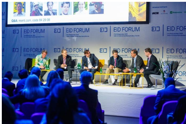
Expert Panel eDebate: "Emerging Vertical mobile ID Markets"