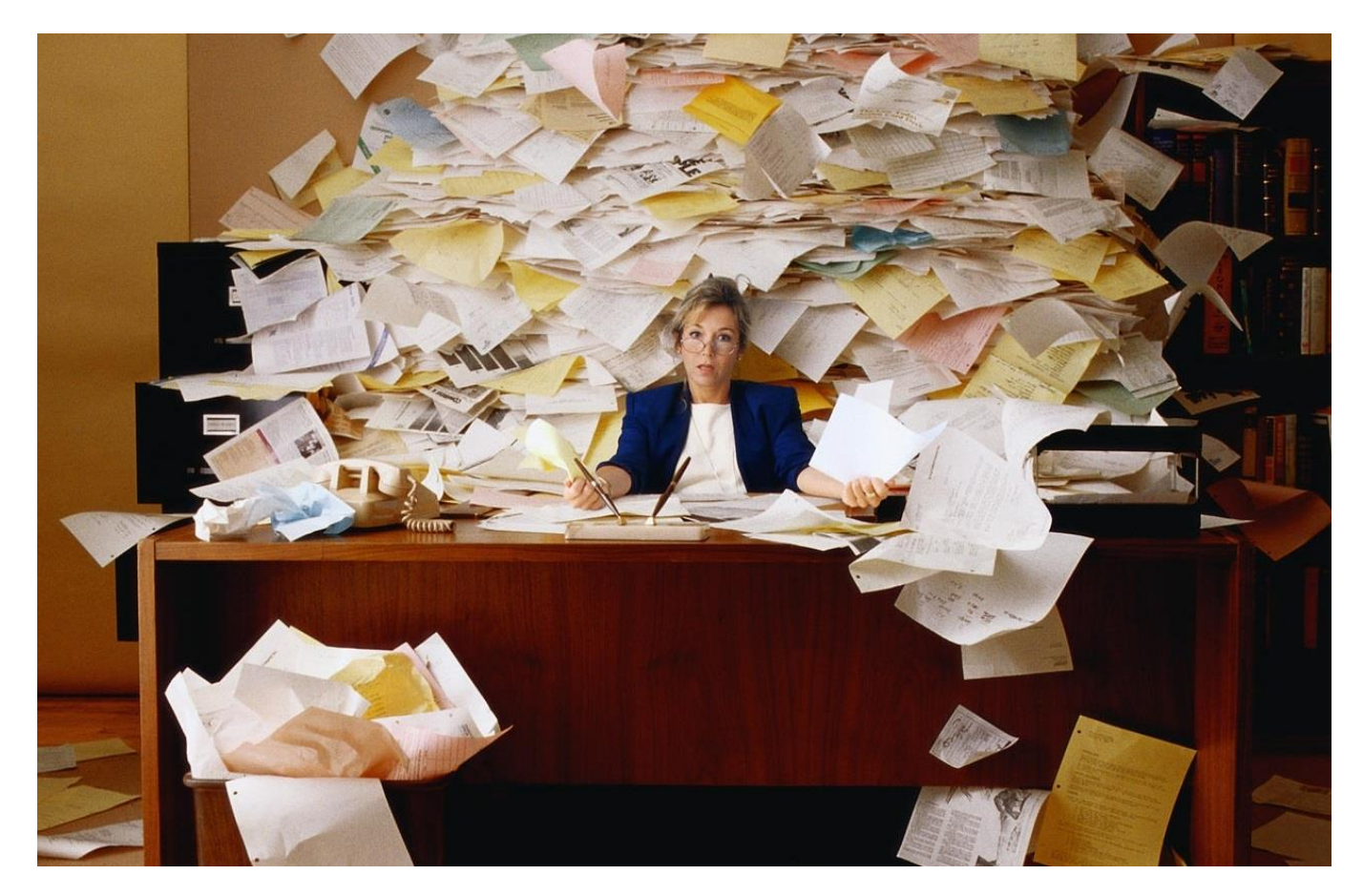
Unknown International Relations Officer, circa 2013